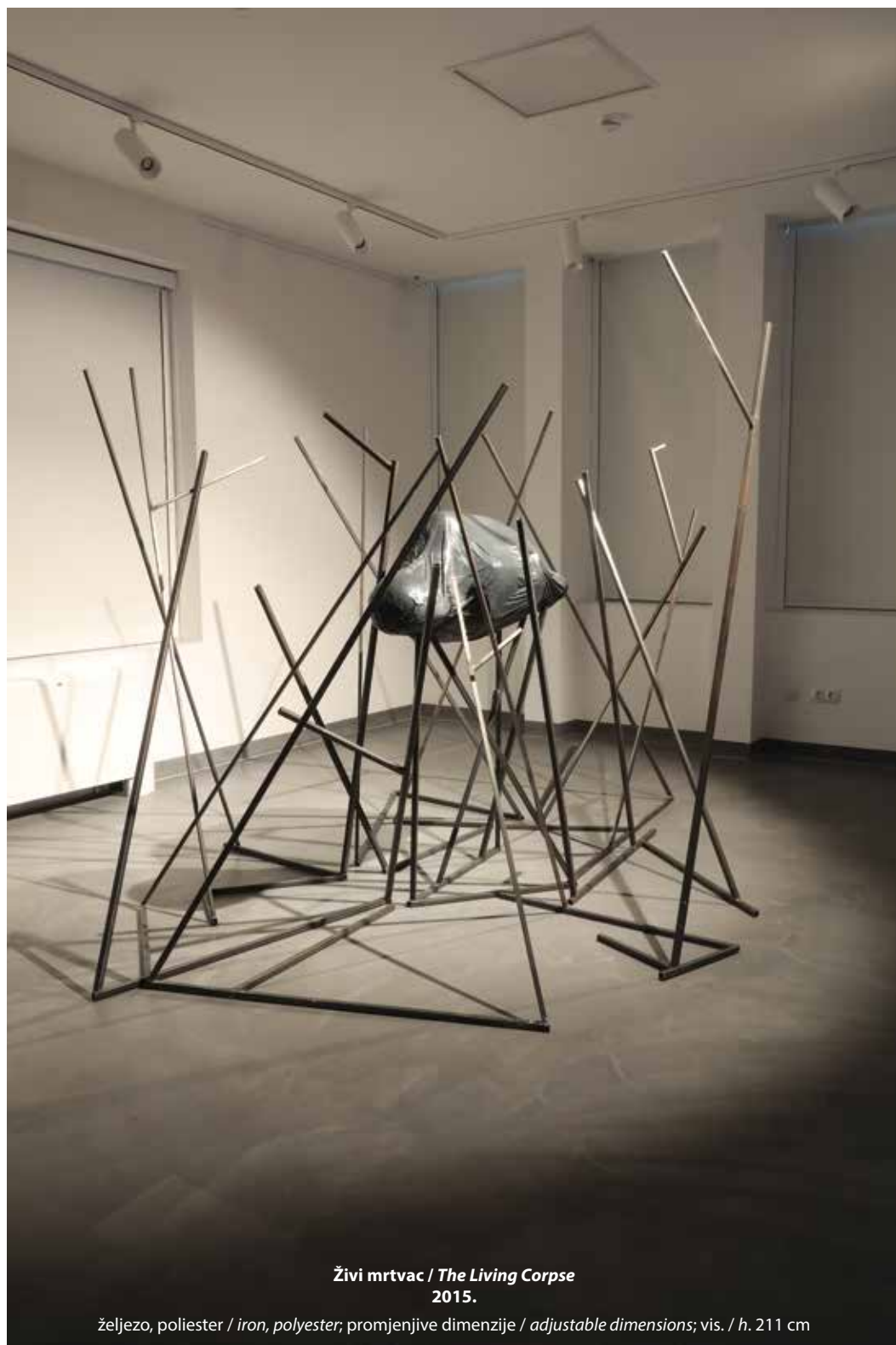
Živi mrtvac / The Living Corpse 2015.

željezo, poliester / iron, polyester ; promjenjive dimenzije / adjustable dimensions ; vis. / h. 211 cm