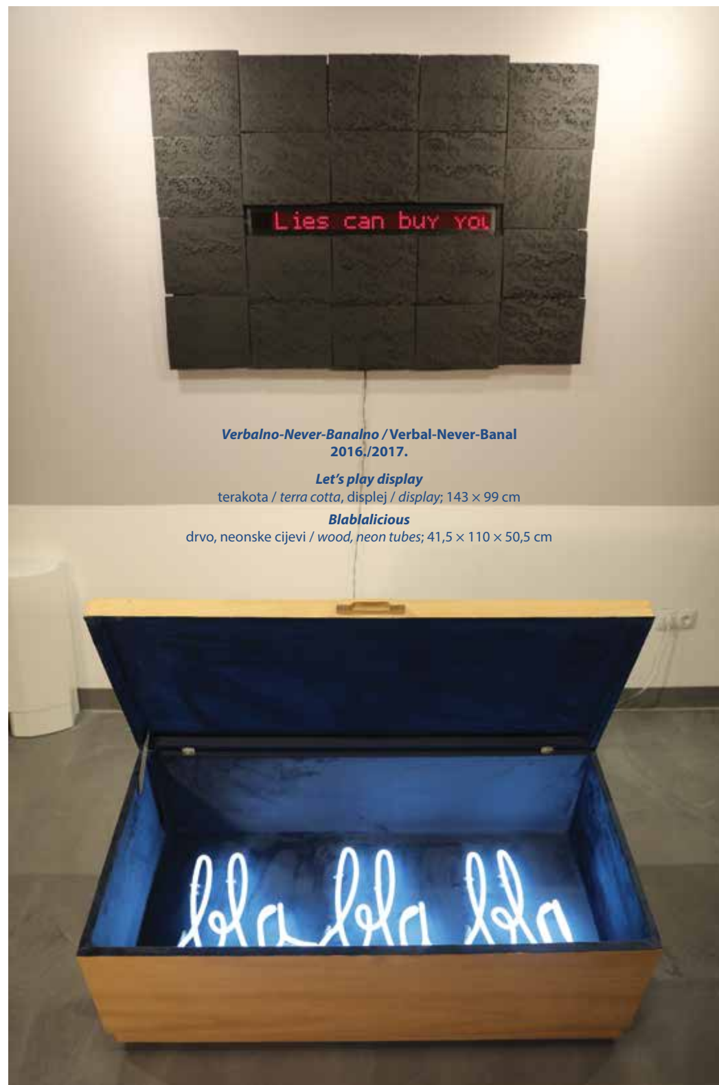
Verbalno-Never-Banalno / Verbal-Never-Banal 2016./2017.

| STUDIO GALERIJE ANTUNA AUGUSTINČIĆA | | 13. X. – 14. XI. 2017. |