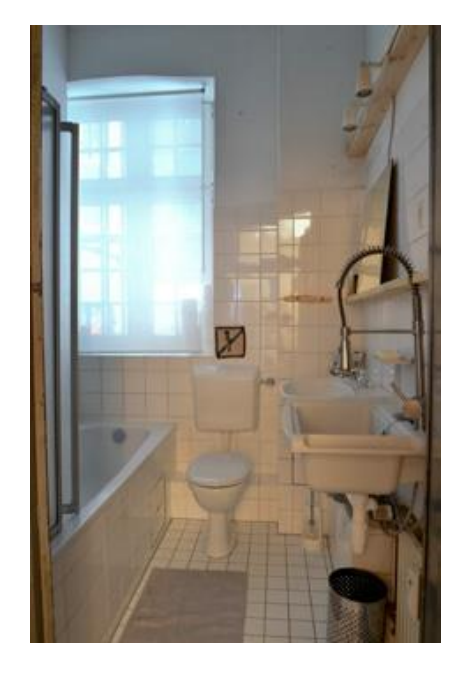
The Groundview | 68qm + 8qm Bathroom